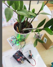
Cyprus: VET Schools as makerspaces for disadvantaged groups. NEETs & ESLs (CIP)