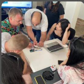
Cyprus: Municipalities as maker spaces for disadvantaged groups (CIP)