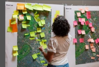
UK: Co-creation Citizen Science event with communities in East London. The River Lea Conservations for Action (UCL)