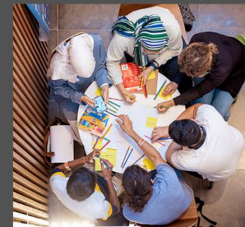
France: COVID- 19 DA. NEETs and Digital Action during the COVID-19 Pandemic (UP)